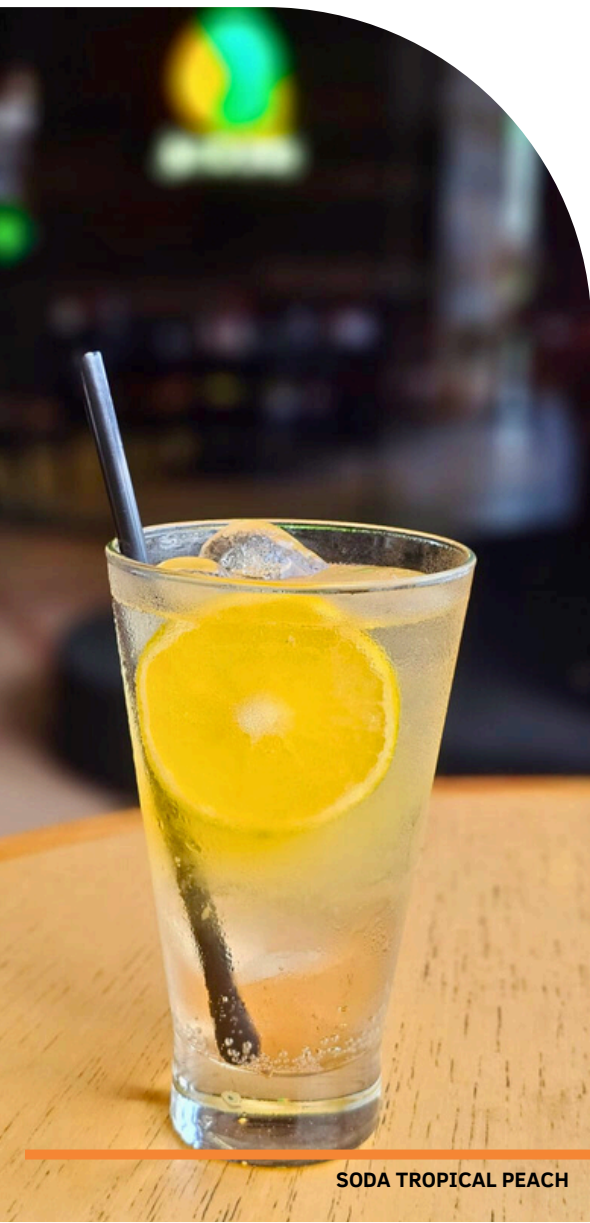
SODA TROPICAL PEACH

Sparkling water, ice, peach syrup and orange shot.